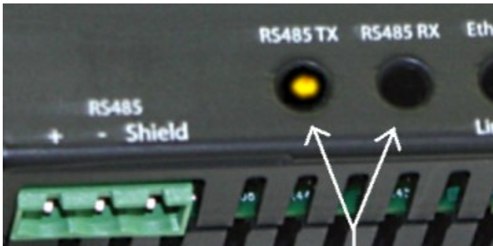
AcquiSuite EMB A8810 RS-485 LEDs

During normal operation, the TX RS-485 LED should blink several times per second, and the RX RS-485 LED should be off most of the time, but may blink when specific devices are queried. The LED placement for an AcquiSuite is shown to the right, and an AcquiSuite EMB is shown to the left.